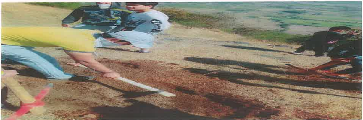
7) CCT WORK AT SLOPES OF BHANDARA DONGAR, JAMVADE