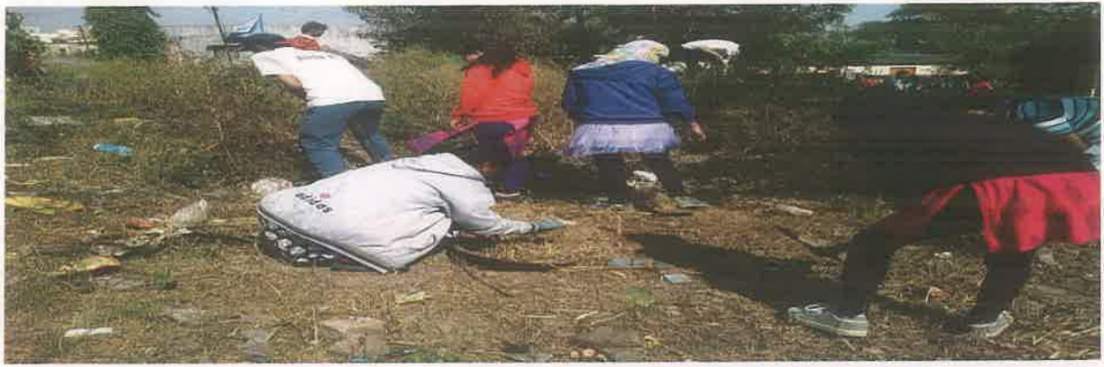
5) SWACHTA ABHIYAAN AT JAMVADE