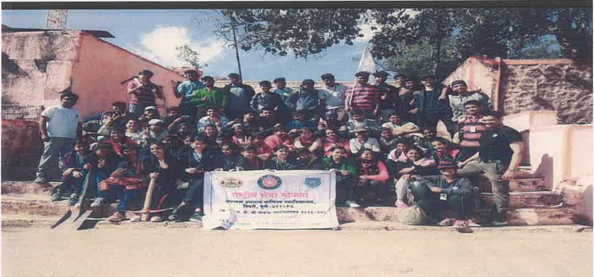
2) SWACHTA ABHIYAAN AT SANT TUKARAM MANDIR ON BHANDARA DONGAR.